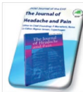
Volume 11 Number 4 Year 2010