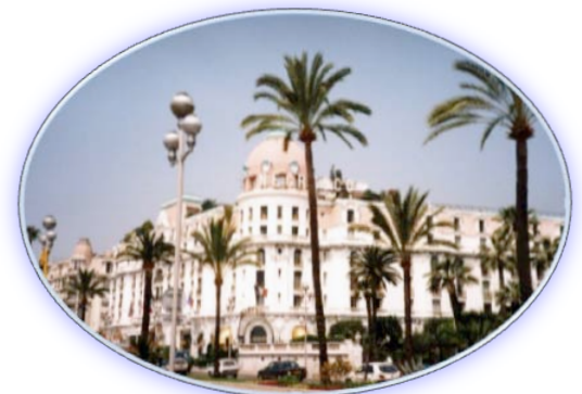
Nice, France (Côte d'Azur)